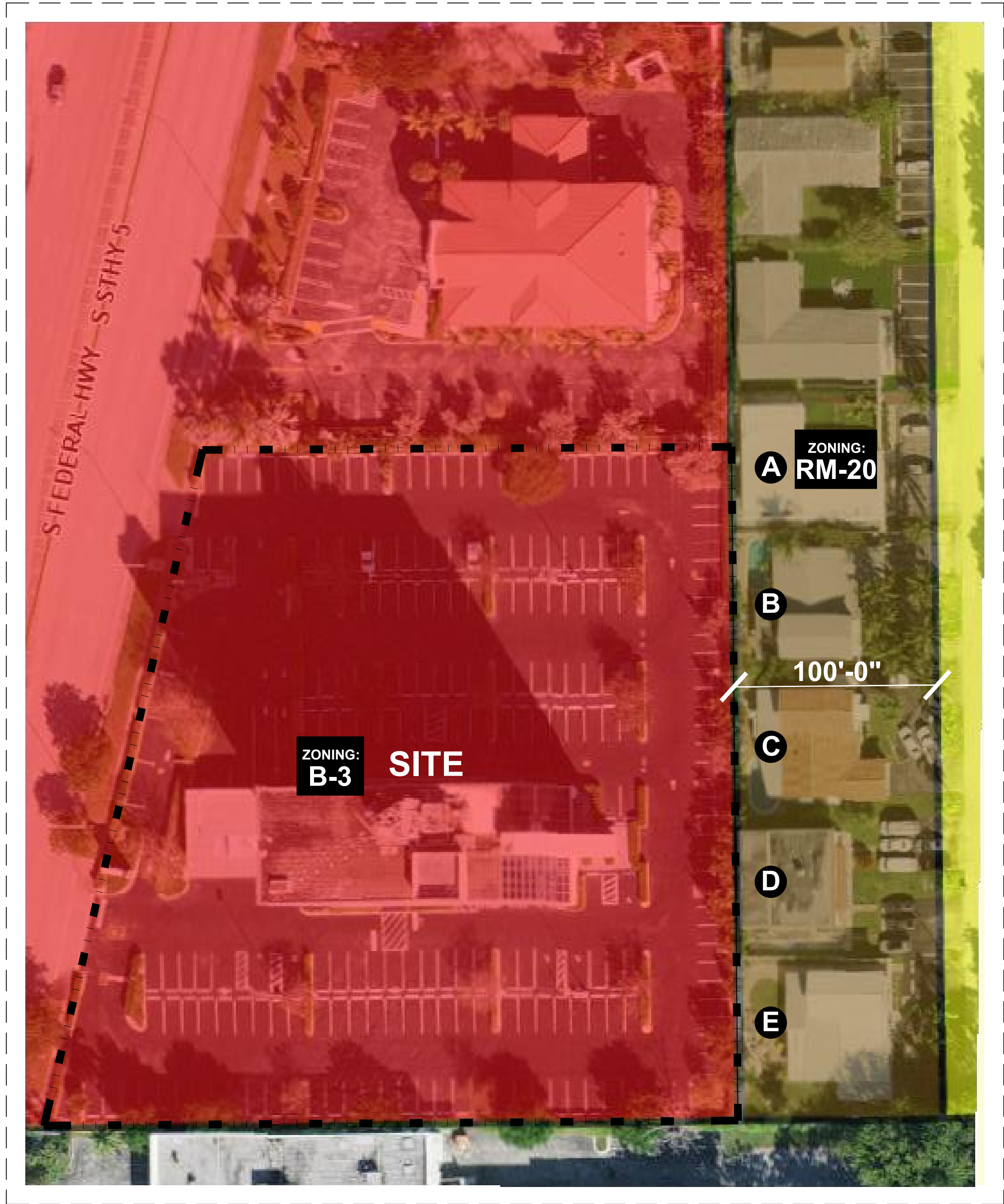
01 ADJACENT ZONING DIAGRAM A-004A SCALE: NTS