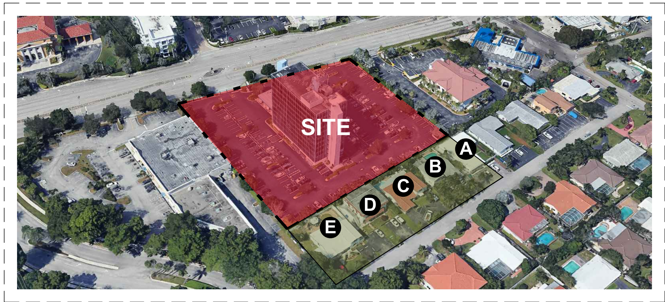
02 ADJACENT ZONING DIAGRAM A-004A SCALE: NTS